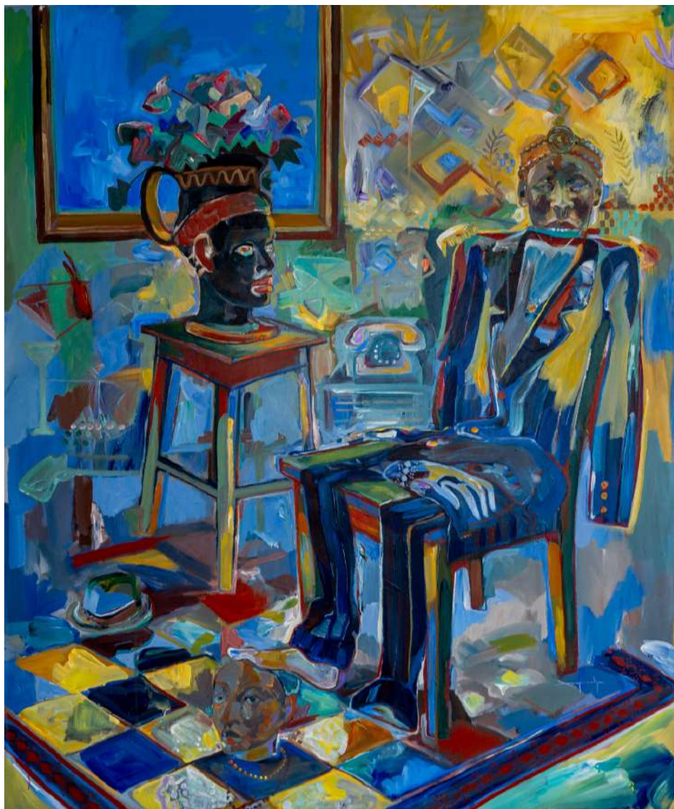
Katamalanasie Acrylic on canvas, 183cm x 157cm 2023