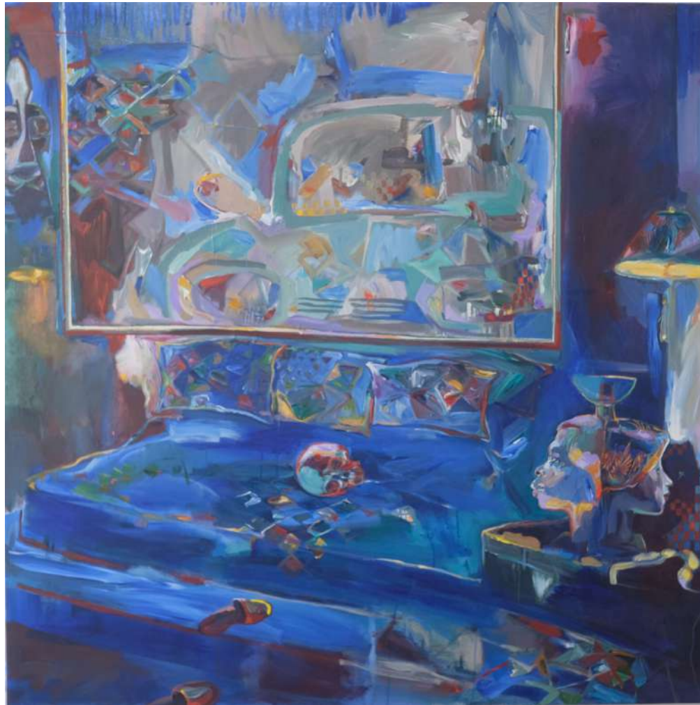
Mysterious blue room, 2024 Acrylic on canvas 160x160cm