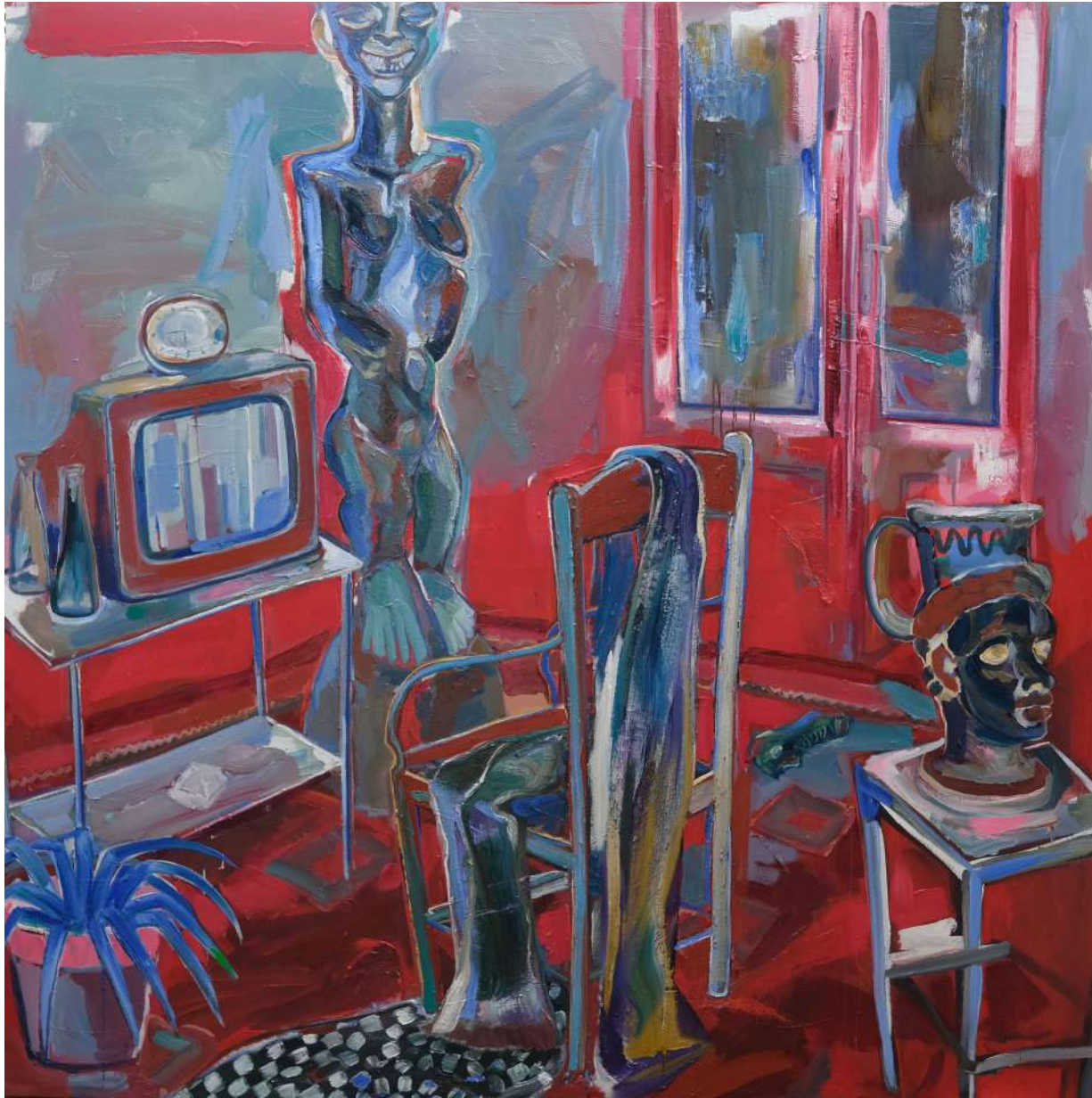
Intérieur Rouge 2, 2025 Oil on canvas 200 cm x 200 cm