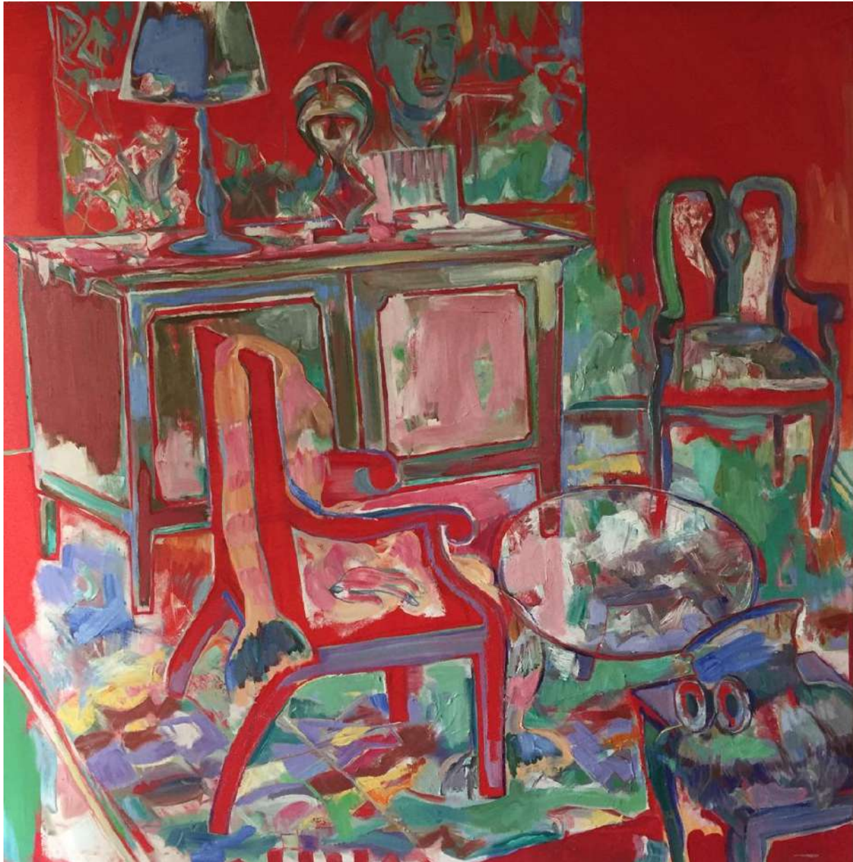
Intérieur d'un danseur Péné, 2025 Oil on canvas 150 cm x 150 cm