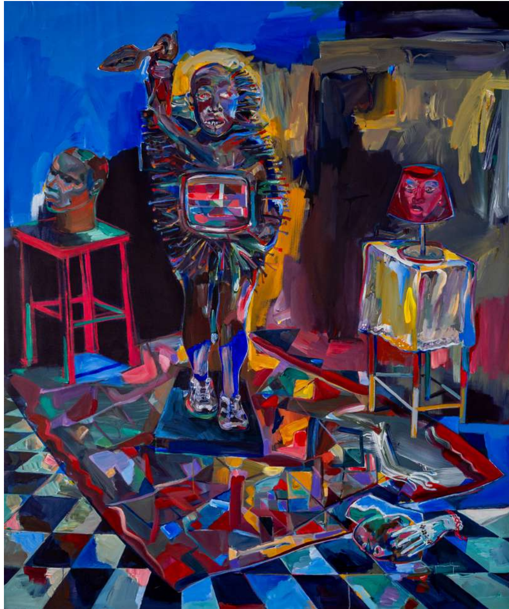
Mbenza, 2023 Acrylic on canvas, 183cm x157cm