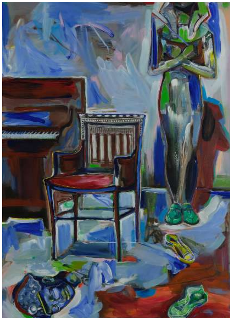
Egyptomanie, 2022 Acrylic on canvas, 150 cm x 110 cm